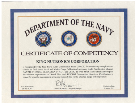
ANSI/NCSL Z-540 Certified Calibration Lab by U.S. Navy