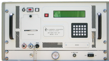
Model 3719 Air Data Test Set