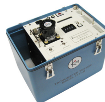
Tachometer Test Set Model 3711-B Mechanical and Optical Calibration

Temperature Calibration from -40^{\circ}\text{F} to 1,200^{\circ}\text{F}