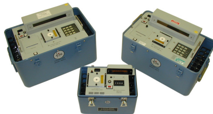
Thermo Units 3603-A compact 3604-A high temperature 3605-A low temperature

Temperature Calibration from -40^{\circ}\text{F} to 1,200^{\circ}\text{F}