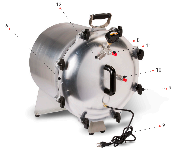
Fig 1. Test Chamber Connections and Features